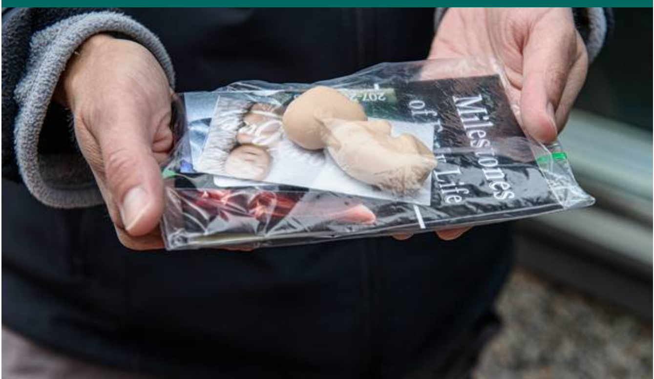
Abortion opponents show a doll of a fetus at 13 weeks.

“ I am what is called "never Trumper". I will never be able to vote for him. He has chosen to be a terrible human being.